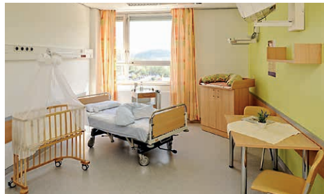
Glance into a patient's room on the maternity ward