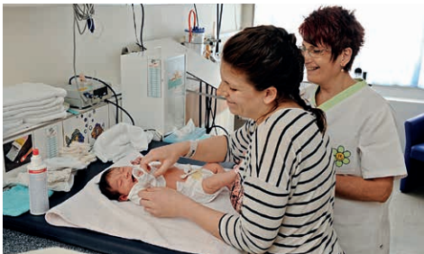
Tips and tricks - how to put on tiny clothes properly ...

Our obstetrics team of midwives, doctors, health and pediatric nurses, breastfeeding and lactation consultants, and our service staff are always available to provide you with advice and support. We hope that the intensive first time of getting to know each other will be an unforgettable and wonderful experience for you and your child.